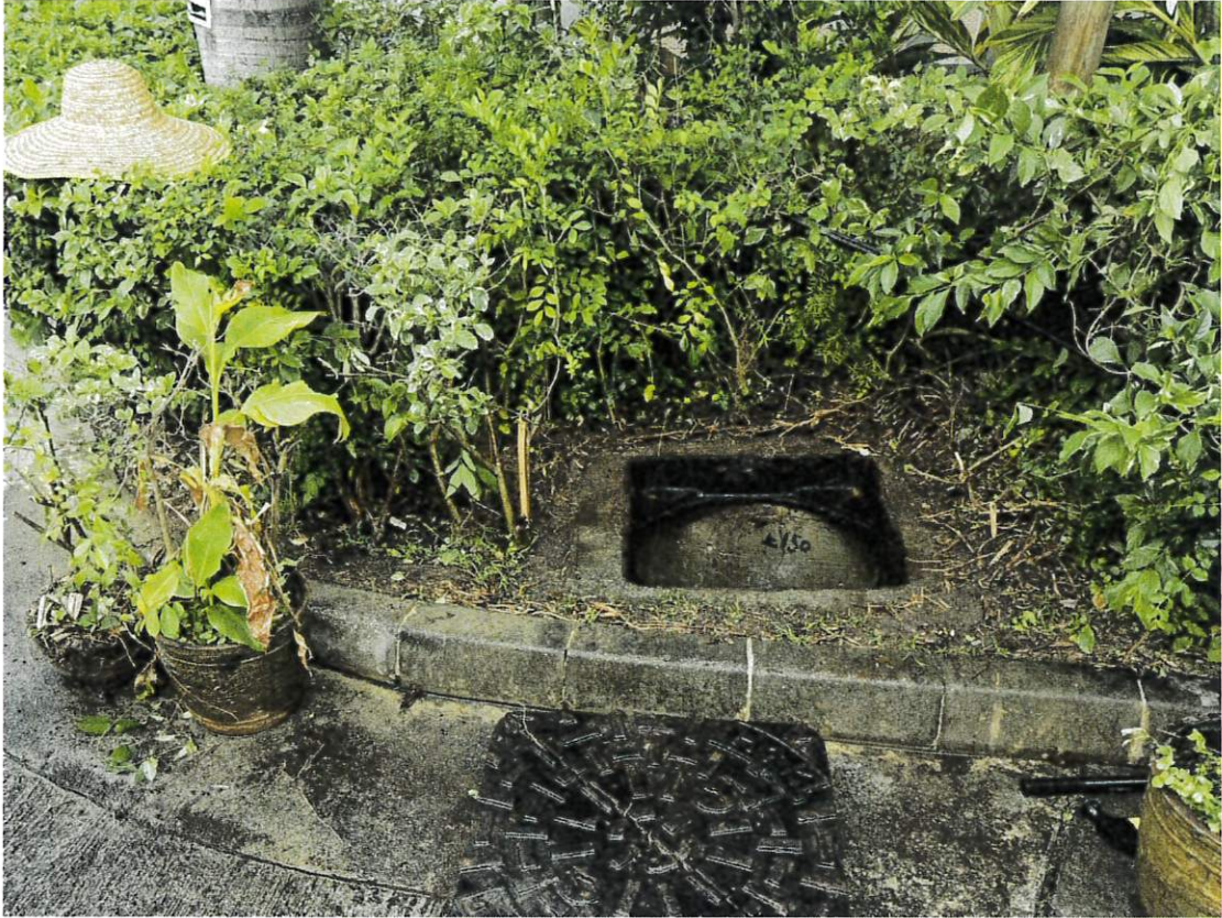
Location of Last Terminal Manhole SWMH1 (View 1) [Photo taking at 29/3/2026]