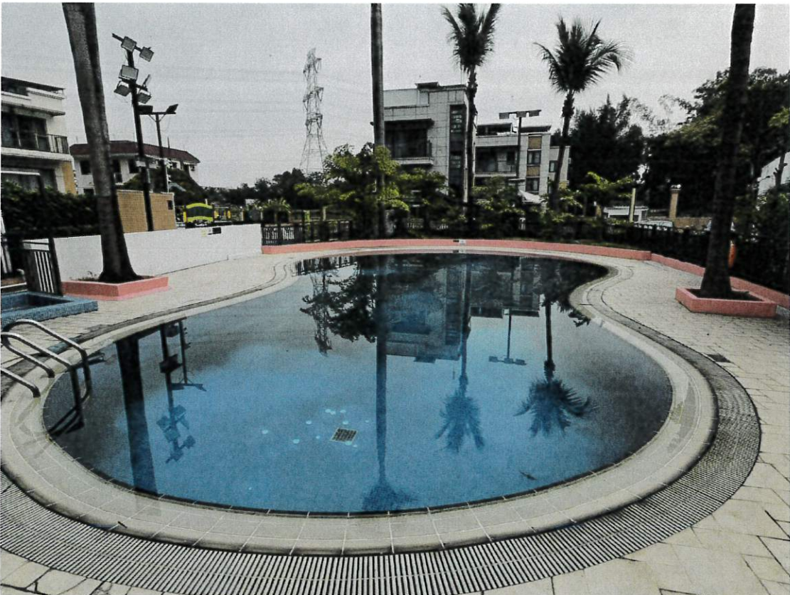
Swimming Pool U-Channel (View 4) [Photo taking at 29/3/2026]