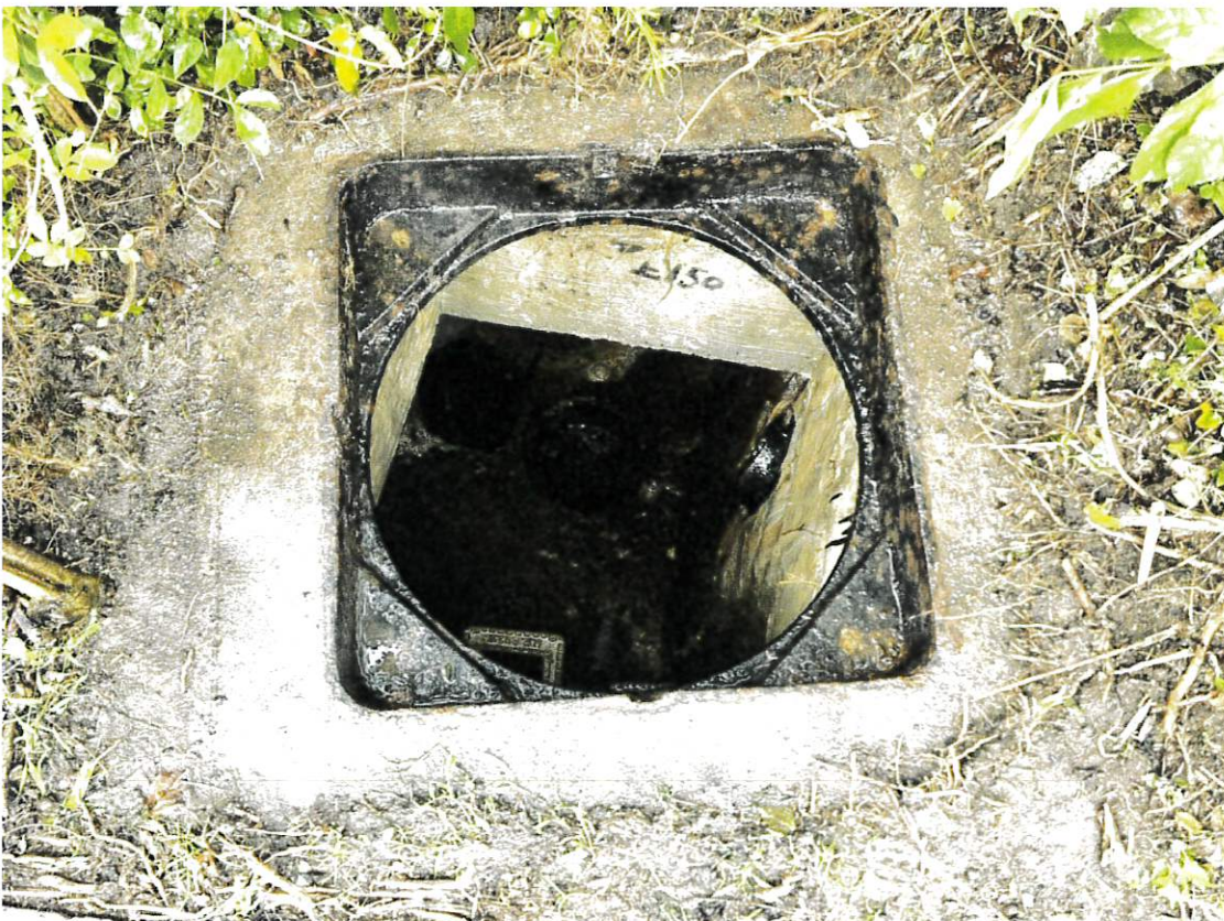
Last Terminal Manhole SWMH1 (View 2) [Photo taking at 29/3/2026]