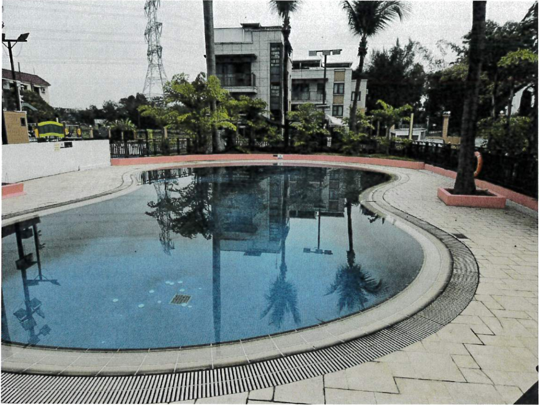
Swimming Pool U-Channel (View 3) [Photo taking at 29/3/2026]